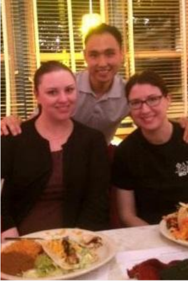
3 former WALs from left to right: